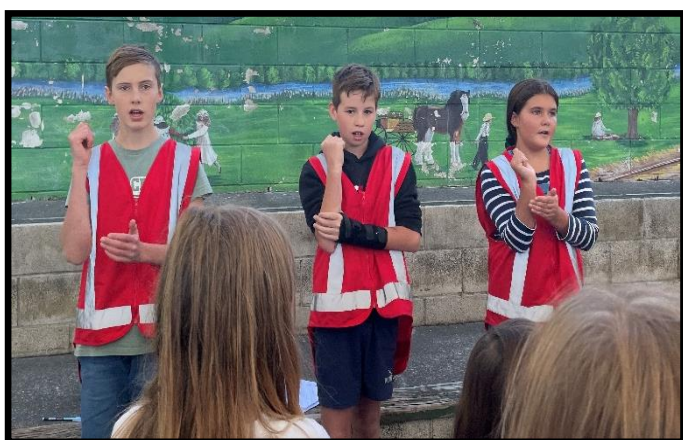
Pohutukawa House Leaders – At our first school assembly leading the National Anthem

Welcome to the first newsletter of Term 2. We have had an excellent start to the term, and it is great being able to look forward to once again participating in all the different activities and sports our children enjoy being involved in. Some of the events we can look forward to on the calendar are the edible arts competition and coastal cluster sporting events.