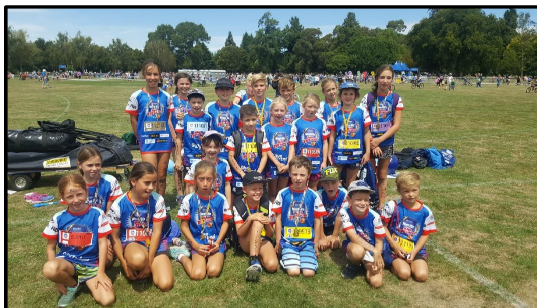
Some of the Eskdale Team, who were left at the end of the day.

Weetbix Tryathlon: On the 15 th of February we had a group of over forty students compete in the Weetbix Tryathlon. This event was held at Frimley Park and there were close to 1500 competitors in total. It was great to see our students pushing themselves in their events and cheering each other on when they weren't competing. The positive Eskdale spirit was certainly on display.