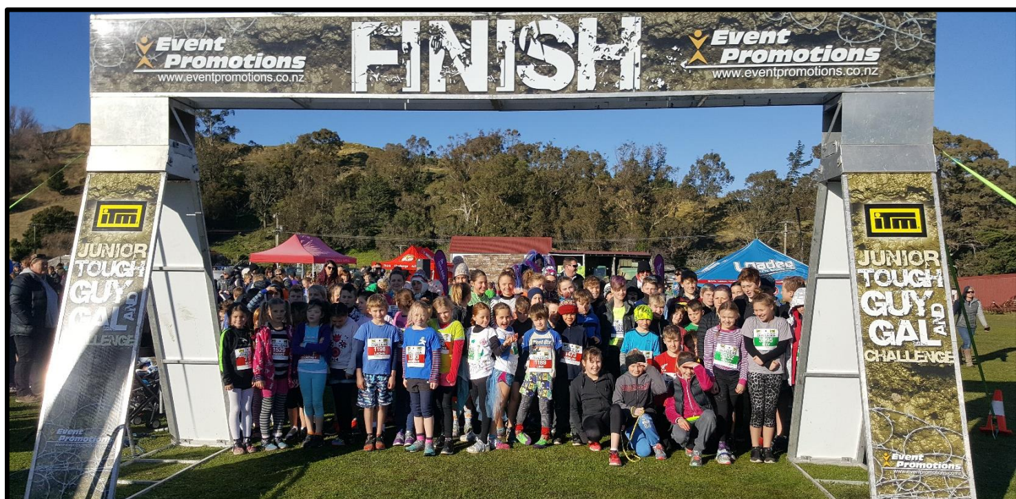
The Eskdale team before the carnage of the mud run.

ITM Junior Tough Guy and Gal Challenge: On Monday we had 83 students compete and complete the ITM Junior Tough Guy and Gal Challenge. It was fantastic seeing our children challenge themselves on the course that had lots of water and of course lots of mud. I know the students certainly felt pleased with themselves for overcoming the challenge that the course provided. It was also great seeing them work together with others to complete the course and giving others a helping hand when needed.