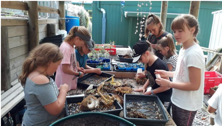
Collecting and saving sunflower seeds for next season

Our year 5 & 6 students have had a busy term with their hands on projects, maintaining the various areas and learning some flax weaving. Many thanks to the family members who have helped us with supervision, enabling us to offer a wide range of activities.